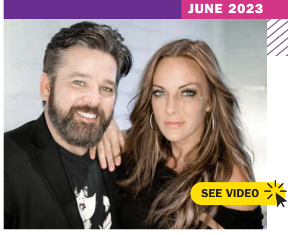
This event has been made possible by our generous season sponsor, Builders FirstSource .