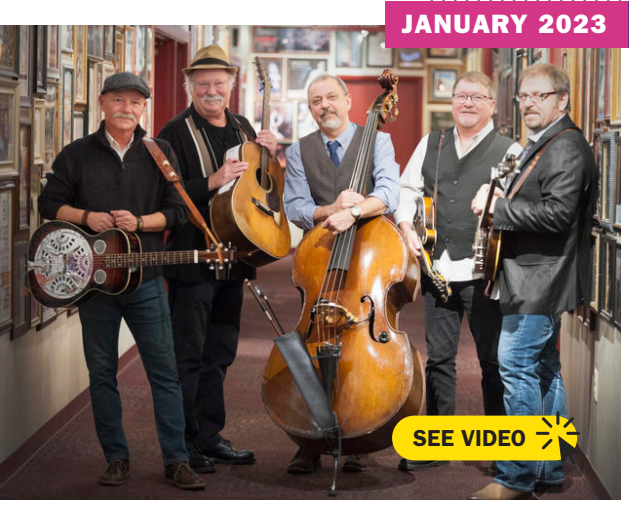
This event has been made possible by our generous season sponsor, Builders FirstSource .