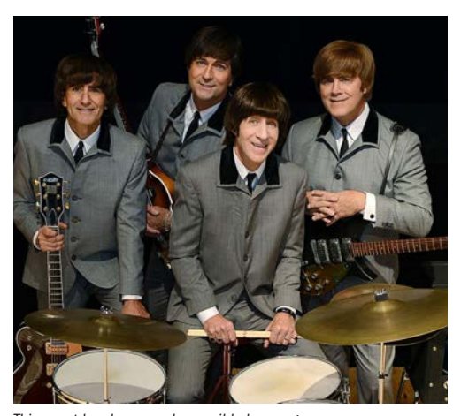
This event has been made possible by our generous season sponsor, Builders FirstSource .