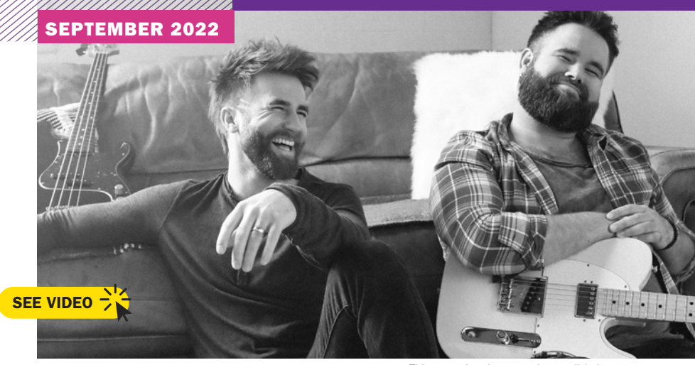
THE SWON BROTHERS