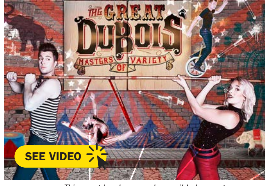
This event has been made possible by our generous season sponsor, Builders FirstSource .