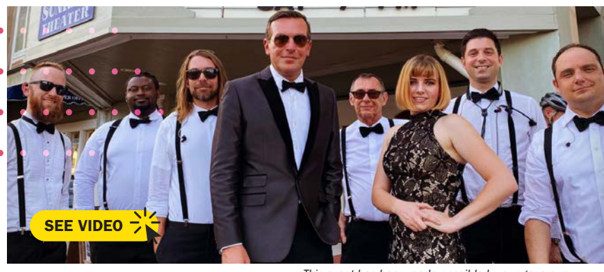
This event has been made possible by our generous season sponsor, Builders FirstSource .