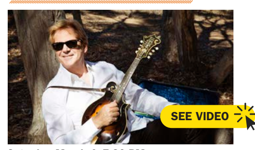
Saturday, March 4, 7:30 PM