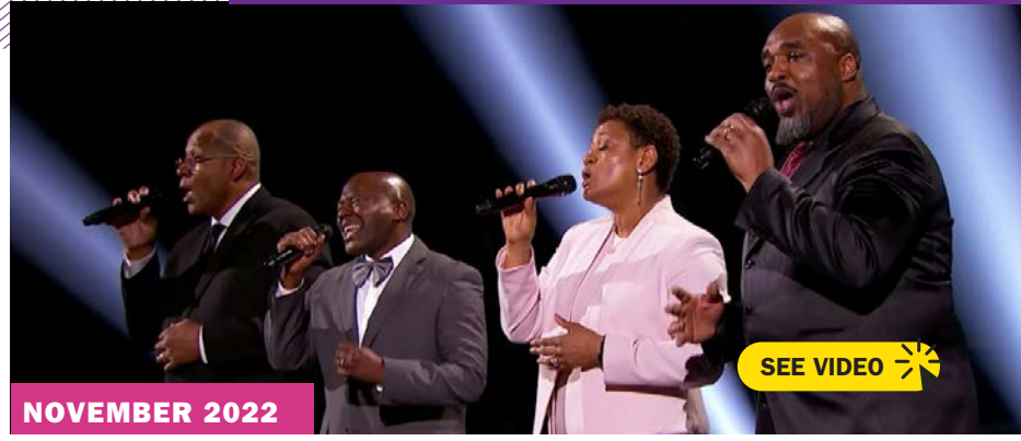
This event has been made possible by our generous season sponsors, Builders FirstSource , and Lake Anna Tractor & Hardware .